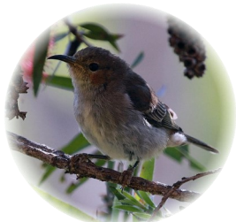
Scarlet Honeyeater (Female)

(All species listed recorded within the grounds of Amamoor Homestead B&B & its' immediate surrounds)