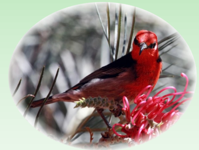
Scarlet Honeyeater (Male) (A. Nielsen)