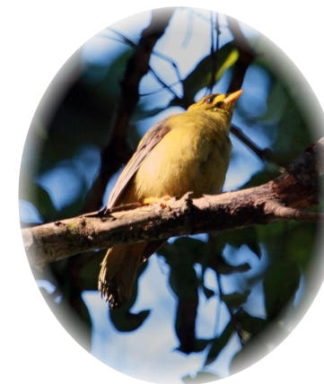
Bell Miner