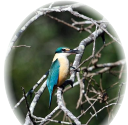
Sacred Kingfisher (M)