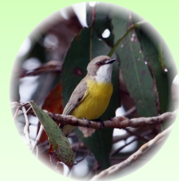
White-throated Gerygone