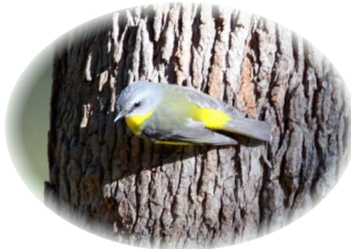
Eastern Yellow Robin

(All species listed recorded within the grounds of Churingas Bed & Breakfast & its' immediate surrounds)