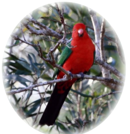
Australian King-Parrot (M)