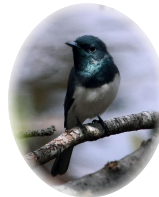
Leaden Flycatcher (Male)

(All species listed recorded from the Bayside Road turnoff off Queen Elizabeth Drive to the “Mullens’ Shorebirds Roost” & through Mullens’ Creek Estuary)