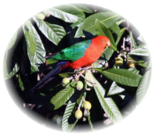
Australian King-Parrot (Male)