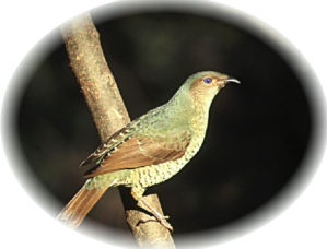
Satin Bowerbird (Female)