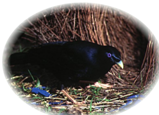
Satin Bowerbird (Male)

(All species listed recorded in the grounds of Patchwork Cottage & its' immediate surrounds) (Refer Webpage "Birds of Patchwork Cottage")