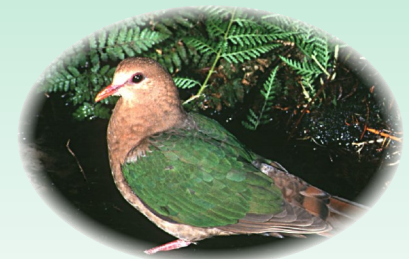
Emerald Dove (B. & V. O'Leary)