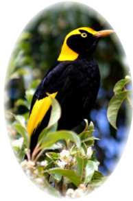
Regent Bowerbird (Male)