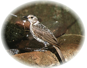
Regent Bowerbird (Female)