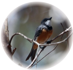
Rufous Whistler (Male)

(All species listed recorded within Rainbow Waters Holiday Park & its' immediate surrounds) (Not including Rainbow Beach)