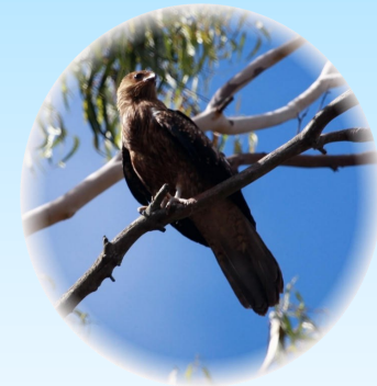
Whistling Kite