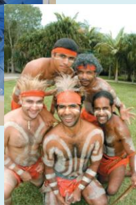
Gubbi Gubbi Dance Troupe