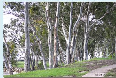
"Art in Nature"

Presentations & Workshops by Local Artists