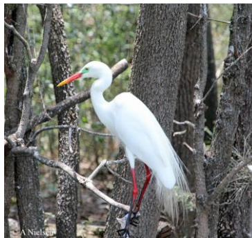
Intermediate Egret

Please Refer to the Web Page “Your Health and Safety while Birdwatching” – http://www.birdingcooloola.org.au/the-ethics-of-birdwatching--other-aspects.html