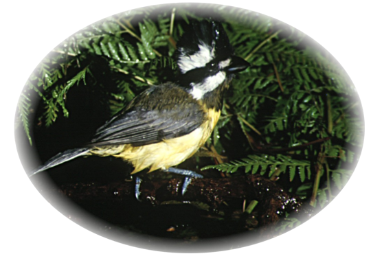
Crested Shrike-tit (Female) (B & V O’Leary)

(All species listed recorded within Amama Picnic Grounds, its’ immediate surrounds, & along the Amama Walking Track to the Cascades)