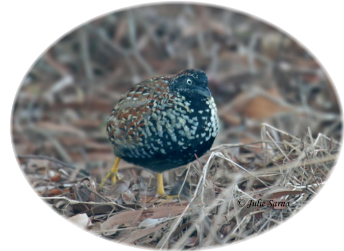
Black-breasted Button-quail (Female) (Julie Sarna - Birds Qld)